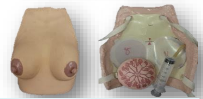
Breast model for teaching breastfeeding

Contact . . . Center for Sexual & Reproductive Health Faculty of Nursing, Chiang Mai University 110 Intravwarorose St. Meuang District Chiang Mai 50200 E-mail: syimyam@gmail.com, susanha.y@cmu.ac.th